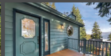
68 NORTH POINT DR • $595,000 • 2,972 SQFT