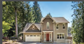
114 WINDWARD DR • $535,000 • 1,964 SQFT