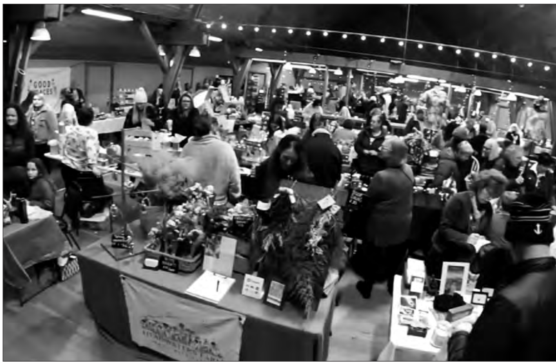
Nov. 19 Holiday Craft Fair at Sudden Valley.

Neither unsigned letters nor letters containing personal attacks of a libelous nature will be published. The Sudden Valley Views reserves the right to edit or refuse any letter. All columns and letters on the opinion page are the views of the authors and do not necessarily reflect the views of the Sudden Valley Views newspaper.