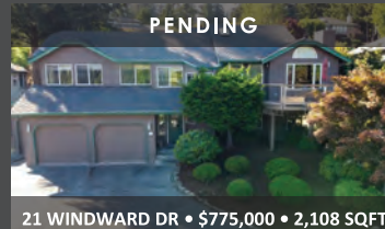
21 WINDWARD DR • $775,000 • 2,108 SQFT