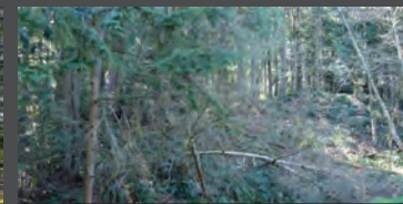
4 TWIN FLOWER CIR • $84,900 • 9,334 SQFT