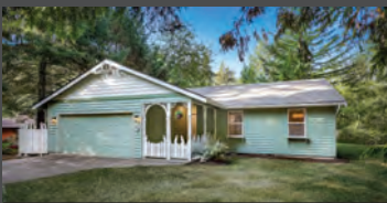
5 SKYLAND CT • $455,000 • 1,196 SQFT