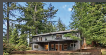
19 FAIRWAY LN • $700,000 • 2,691 SQFT