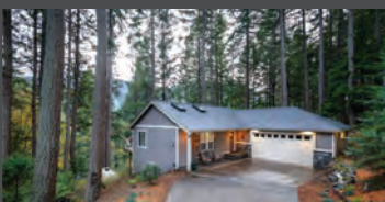
51 VALLEY CREST WY • $639,900 • 2,345 SQFT