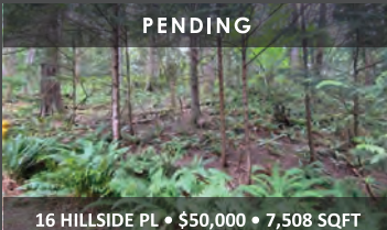
16 HILLSIDE PL • $50,000 • 7,508 SQFT