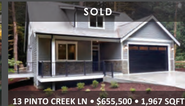
13 PINTO CREEK LN • $655,500 • 1,967 SQFT

All showings are by appointment only. Brokers must follow all NWMLS showing guidelines. Call to schedule yours today!