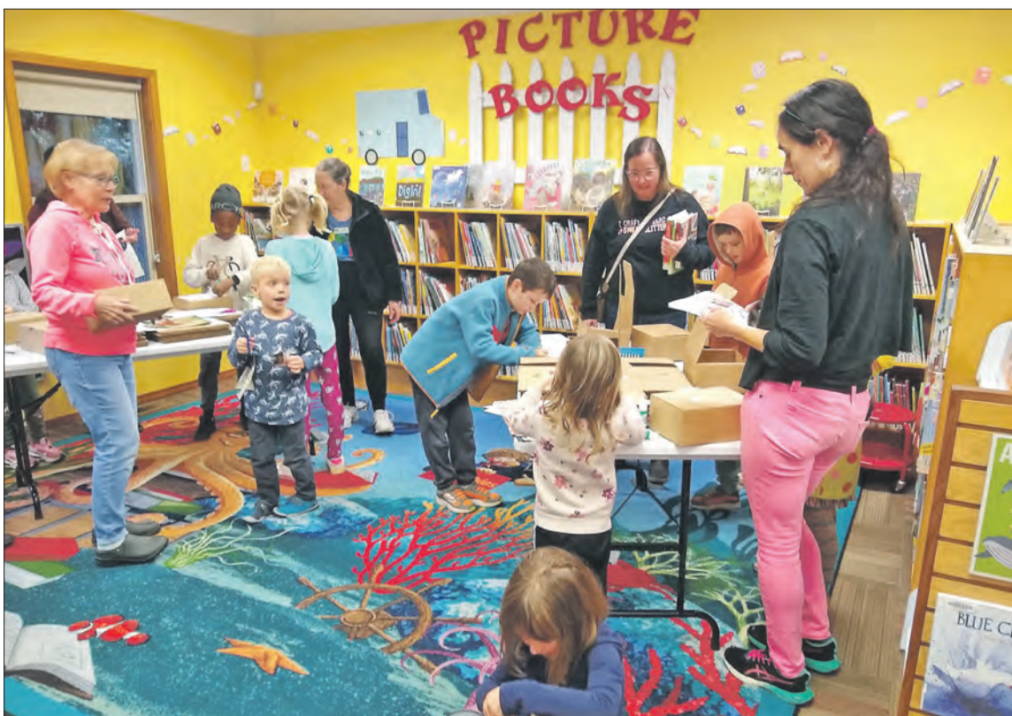
Come join your friends at the South Whatcom Library for fun events like this build a treasure box, Tuesday Lego club, or Tweens learn to knit. Come borrow a book, hear a story or borrow a book or even an American Girl doll. Go to WCLS.org for more information.

Did you know that kids here in our community wrote a book about Sudden Valley that you can buy on Amazon, and hopefully here in the valley soon. Great job girls.