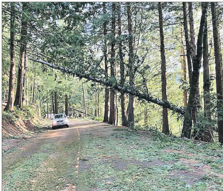
The windstorm experienced on Tuesday, Nov. 19, caused hundreds of trees and limbs to fall, and damaged many properties throughout the valley.