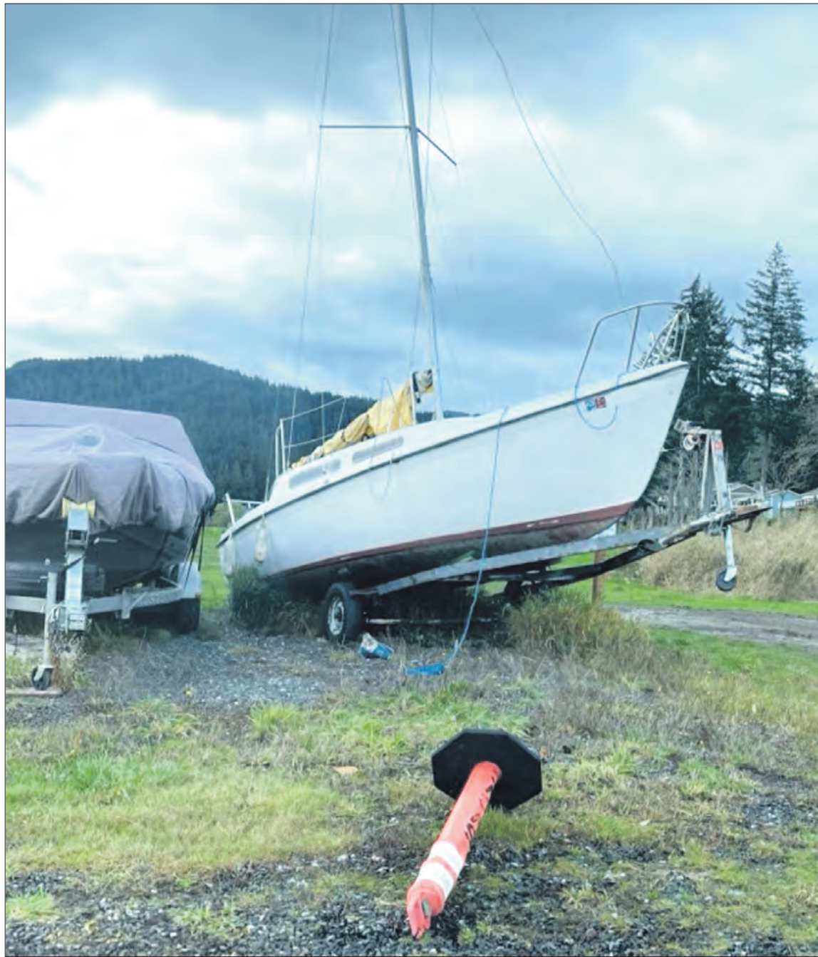
At left, The boat launch gate was closed after of the arms was broken in the November Bomb Cyclone. A sailboat tipped back on its trailer, above, during the November Bomb Cyclone. Below, a small non-motorized sailboat capsized in the marina during the heavy atmospheric rivers in October.

In November, a powerful bomb cyclone struck the area, leaving its mark on the marina. The storm displaced a 14-foot boat from its position, tipped a sailboat backward on its trailer, and damaged the marina's boat-launch gate, which has since been repaired.