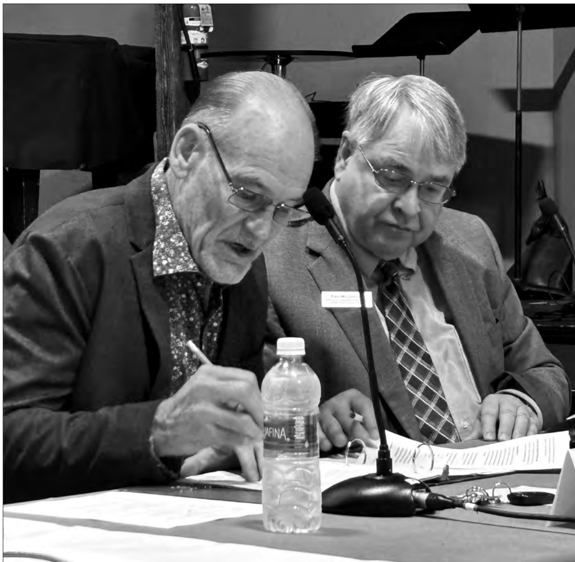
November began with the Annual General Meeting, pictured, and ended with a focus on helping members recover from windstorm damage, clearing the roads of fallen trees and debris, and removing the remaining hazardous trees.