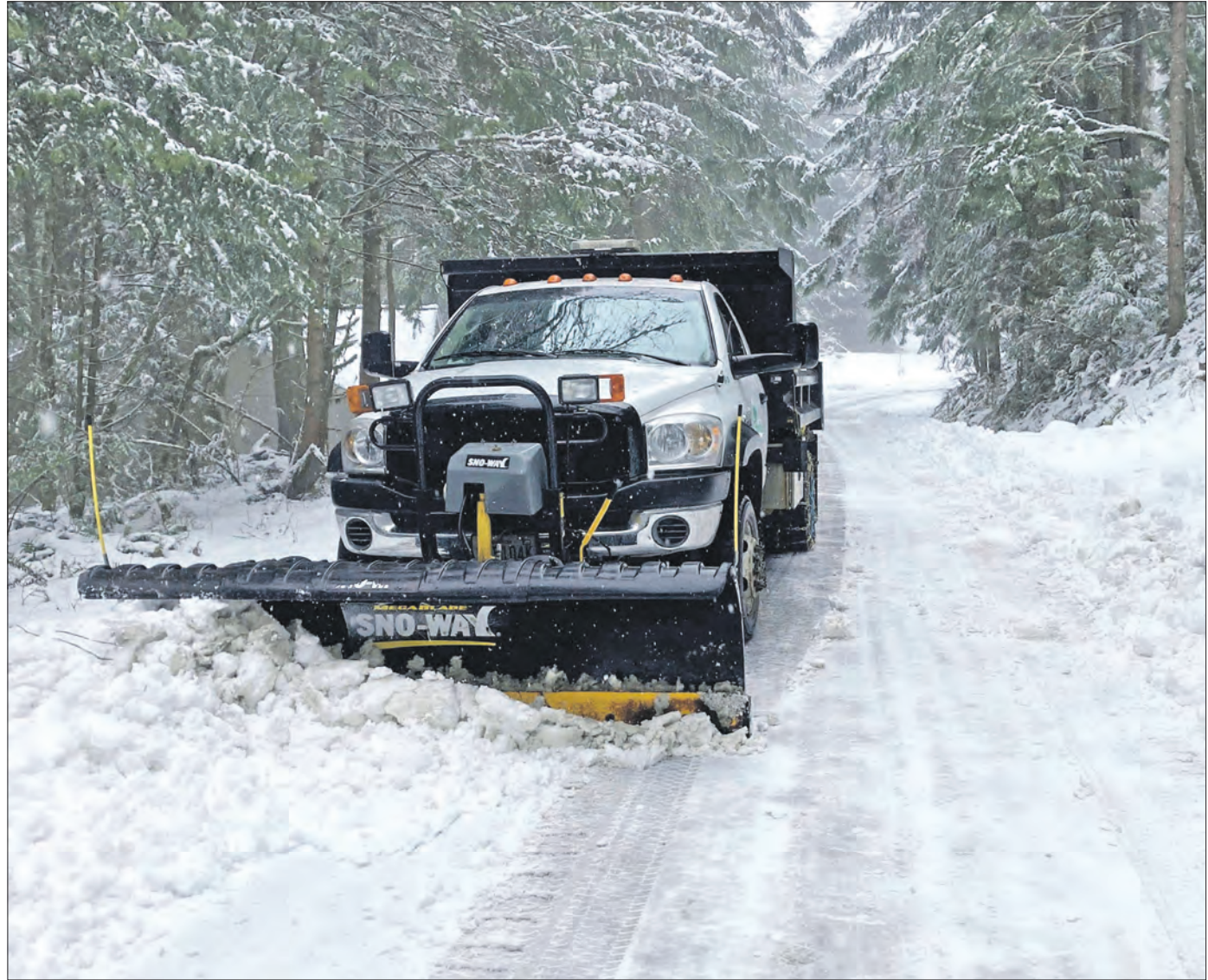
Sudden Valley Community Association's goal of snow removal is to ensure that residents and emergency services can get into and out of the community during weather events.